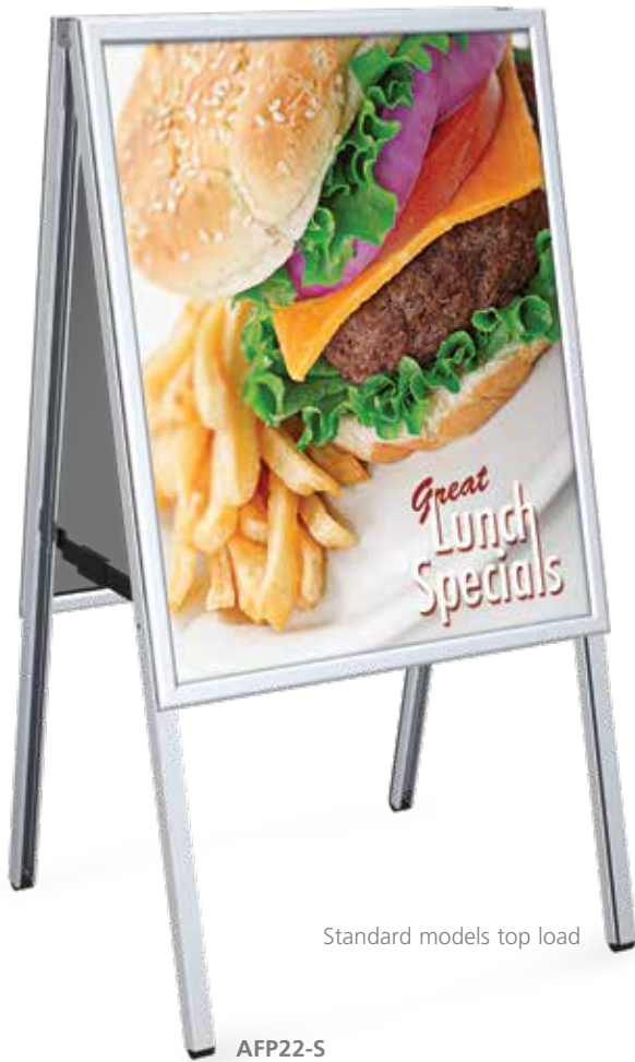
Standard models top load