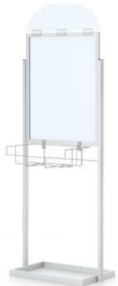
LF328-S WITH SLB3 & HD1