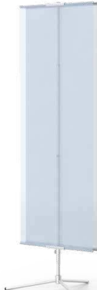
BN2PB-S Presto Base. Use with travel bags.