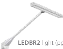
LEDBR2 light (pg. 167)

Lights, Bags & Literature Baskets available.