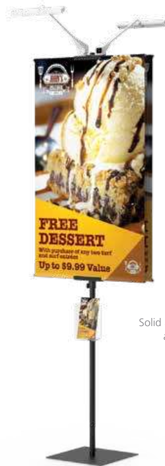
BN2SQ-B with LEDBR2 light (pg. 167), and PB1C Brochure Holder.