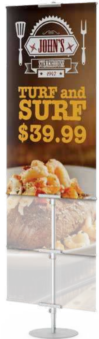
BN2RD-S Round Base. The most elegant style.