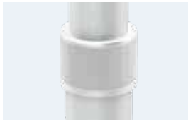
Solid aluminum adjustable clutch lock.