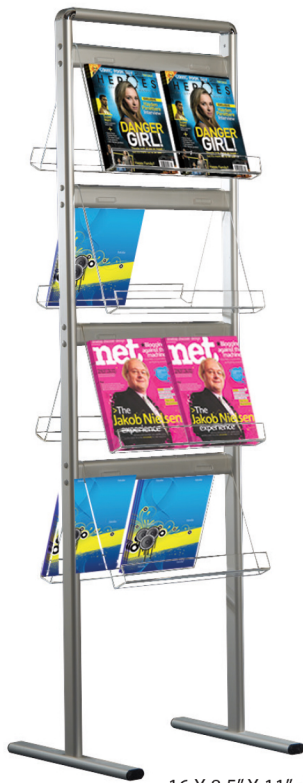
16 X 8.5" X 11" double sided

Wheels are optional, not included in the original pack. Shelves are packed separate in a protected box.