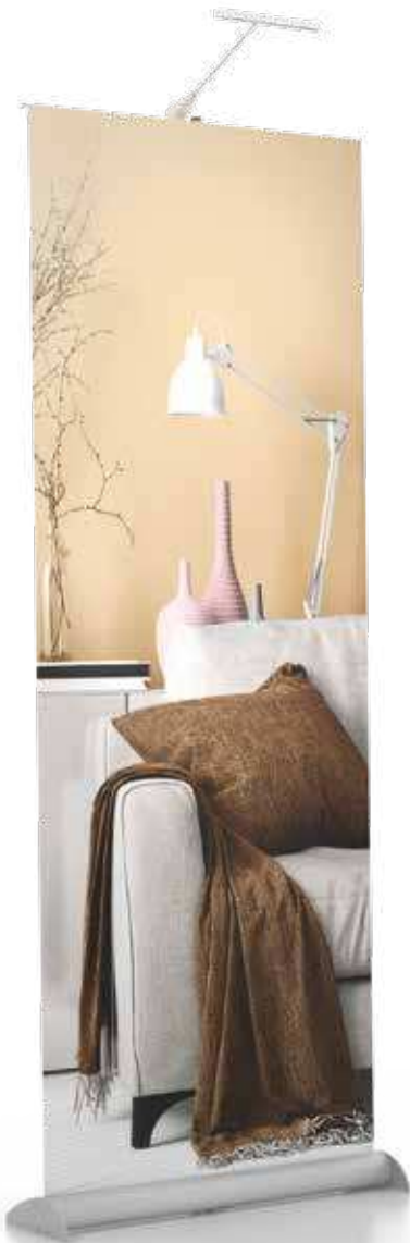
RY1-S with LEDBR1 light.