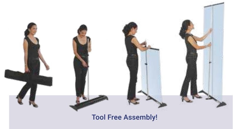
Tool Free Assembly!