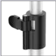
"G" Lock allows quick height adjustments.

Tremendous value & still made in the USA!