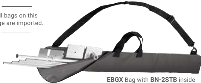
EBGX Bag with BN-2STB inside