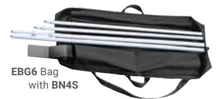
EBG6 Bag with BN4S

EBGC 22" x 4" x 3" bag for Cascade Lights only.