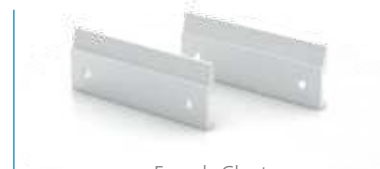
French Cleats for hanging included