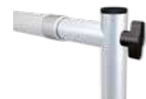
Twist lock offers infinite horizontal and vertical adjustments.