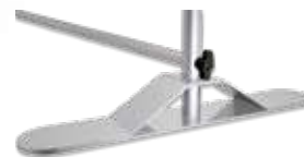
Sturdy Steel "Bridge" Support Base.

Note: For heavy weight vinyls & graphics, special order uprights with B locks. Extra cost applies.