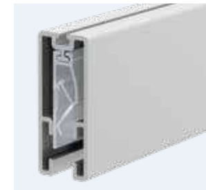
SN5 SnapGraphics .050" capacity.