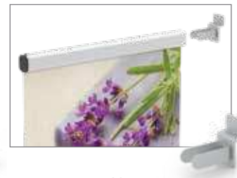
UCSWB Slatwall bracket - set of 2 for 36" max. Perpendicular to wall.