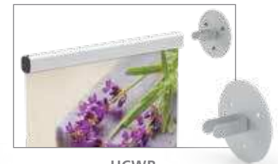
UCWB Wall Mount Bracket - set of 2, 3-1/4" diameter. For 36" maximum. Indicate - B Black or - S Silver