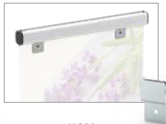
UC44 Wall Mount Kit for SN1 & SN2 Set of 4.