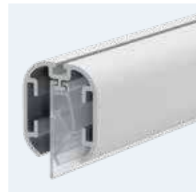
SN1 SnapGraphics .070" capacity.