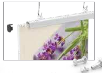
UCSP Aluminum Screw Posts, set of 2. Slide graphic 3/8" max. thick into casing.