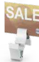
Double Clamp-On SignHolder